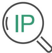
IP Check Tool