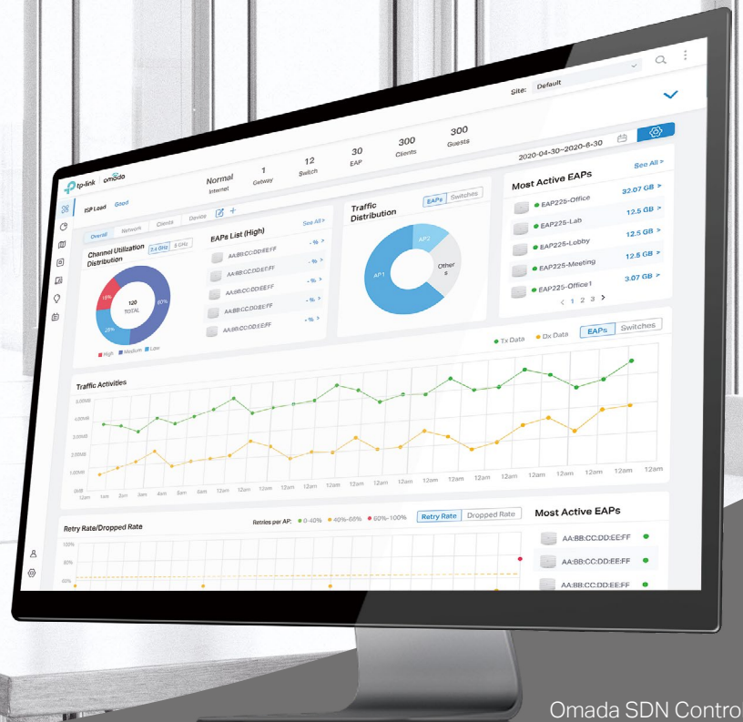
Omada SDN Controller