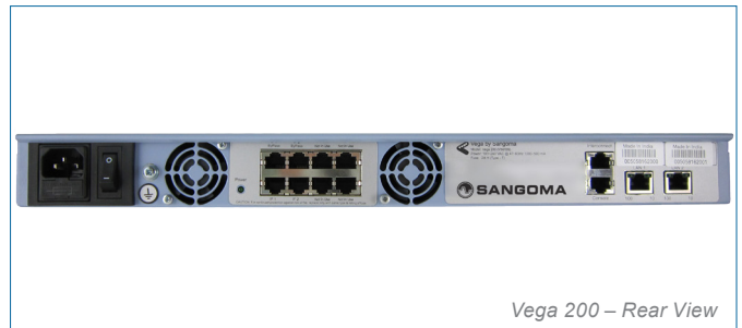
Vega 200 – Rear View