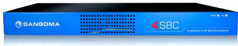
Vega Enterprise SBC 1U Appliance