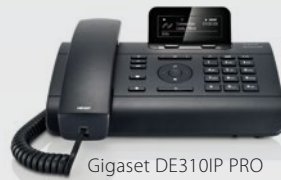
Gigaset DE310IP PRO

The following Gigaset pro IP desktop phones are available for direct connection on the Hybird 120 GE: