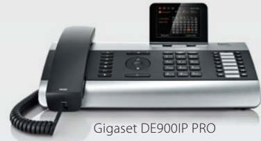
Gigaset DE900IP PRO