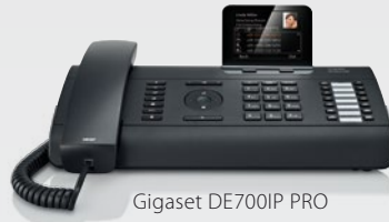
Gigaset DE700IP PRO