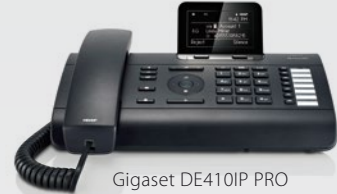
Gigaset DE410IP PRO